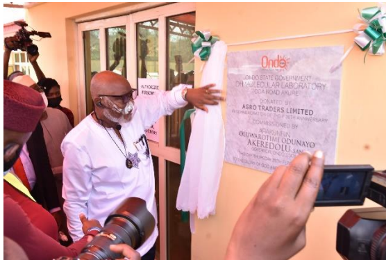
Commissioning of Molecular Laboratory at Infectious Disease Hospital