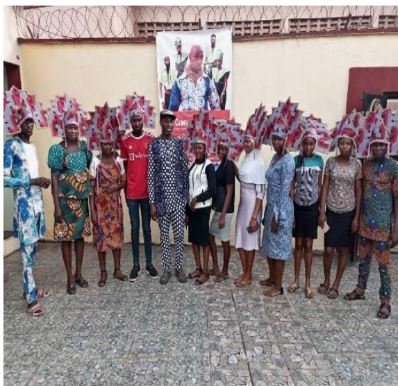
Street to Skill