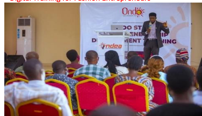
ICT skills among unemployed graduates