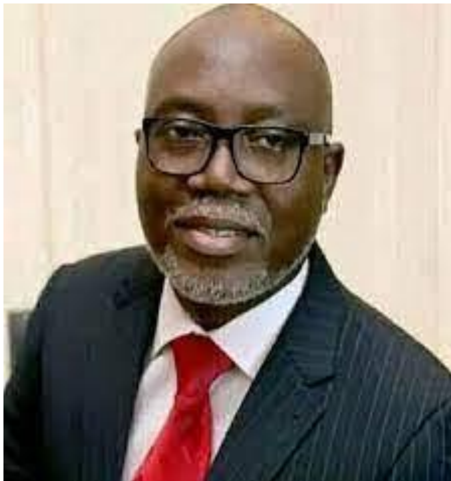
Hon. Lucky Orimisan Aiyedatiwa ONDO STATE DEPUTY GOVERNOR/CHAIRMAN HCD COUNCIL