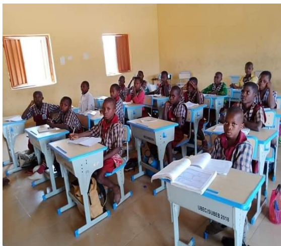
Class Room Environment