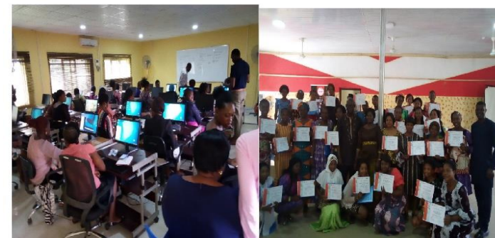
Digital Training for Fashion Entrepreneurs