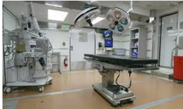
Trauma Centre in Ondo