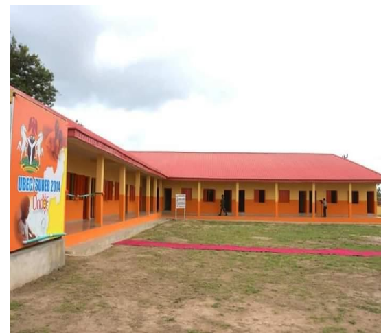
Prototype of Rural Schools across the State